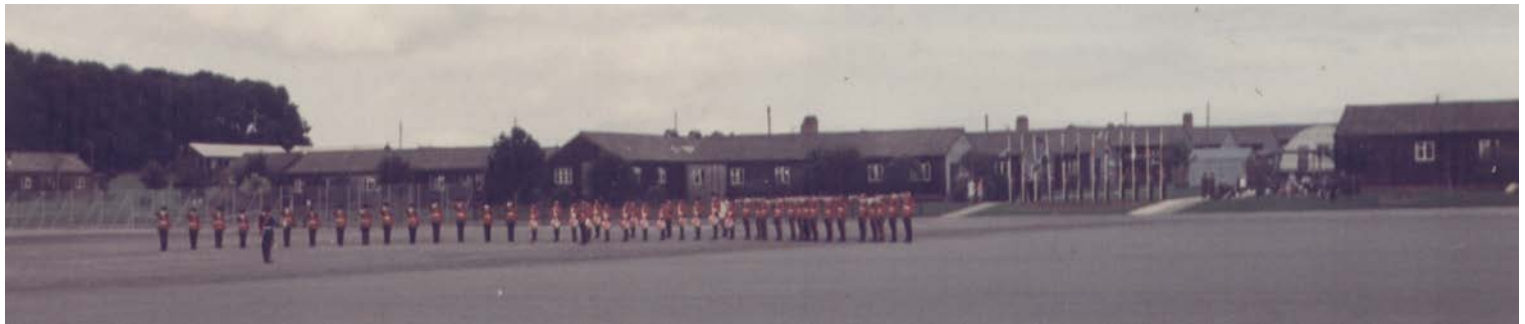
Beat retreat Vee formation