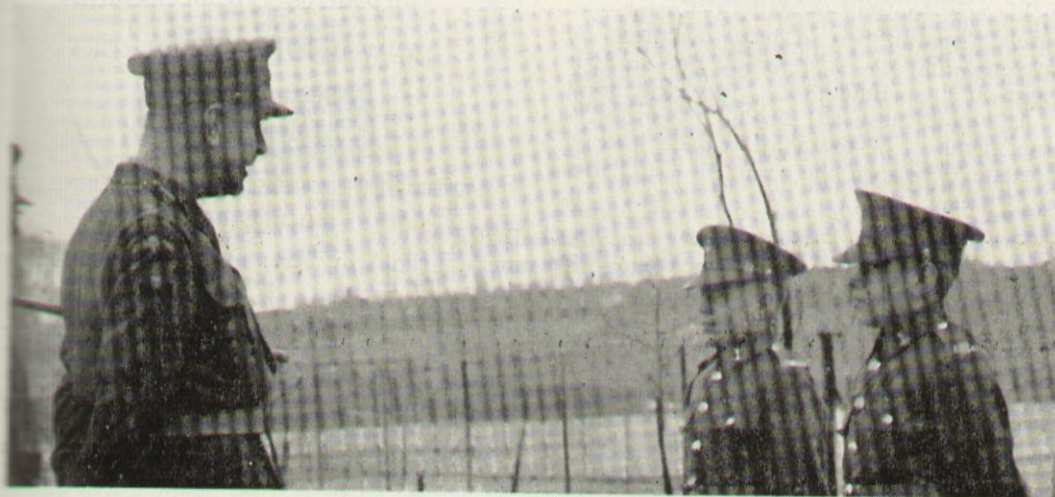
The Swift Twins Greet the S.O. in C.