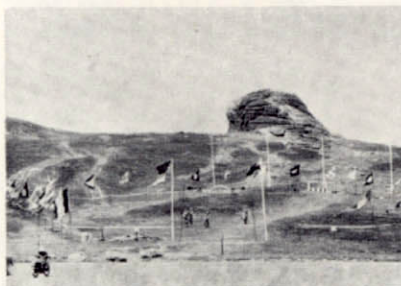
Haytor and the Start of the Expedition

It was cold as we got up and packed up our kit ready for the march; but the day had already begun to warm up by the time we arrived by bus at Haytor.