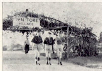
The Entrance to Ten Tors Village

People believe that the Ten Tors Expedition starts at Haytor Rocks, but for competitors this is not so. We trained over Dartmoor regularly during the previous month, doing different treks every weekend. The previous night we had forsaken our comfortable beds in the barrack room to put up a tent and join the other competitors in Ten Tors Village, on the bottom sports field at Denbury Camp.