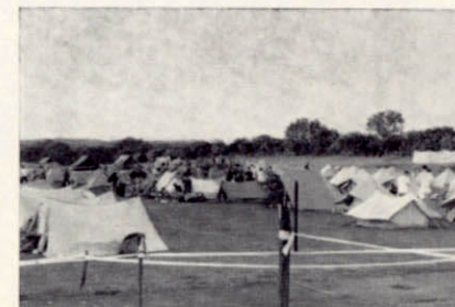
Ten Tors Village

It was cold as we got up and packed up our kit ready for the march; but the day had already begun to warm up by the time we arrived by bus at Haytor.