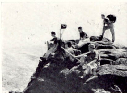
A Welcome Rest

We knew that all we had left now was the last check point at Hare Tor, and then down to the finish. Again sheer excitement brought about a quickening of our pace, but it didn't last. By this time we were all exhausted, marching mechanically—rather as if we were in a trance. At last we could see the finish, and we found ourselves breaking into a little trot. The relief was nearly unbearable as we finally crossed the finishing line.