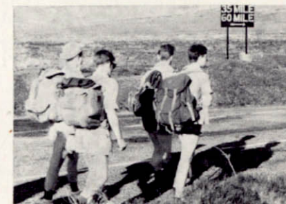
There's a long long road a'winding

Certain of the signposts seemed funny, we learned afterwards that there had been some tampering, but we relied on our map. Gradually the day got 'hotter and hotter', we didn't get to our first check point until nearly three o'clock. Next came King Tor but by this time the heat was becoming unbearable, so we rested after being checked in there.