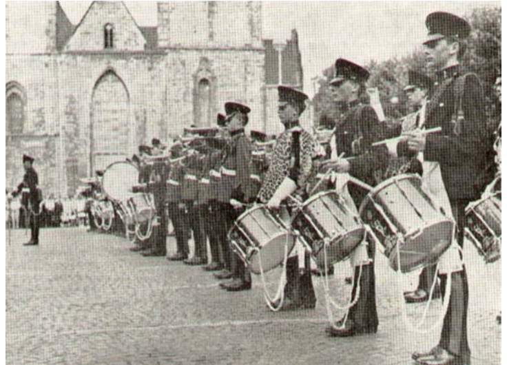
Awaiting the arrival of the Burgermeister of Herford