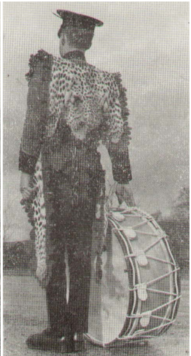
New Leopard Skin