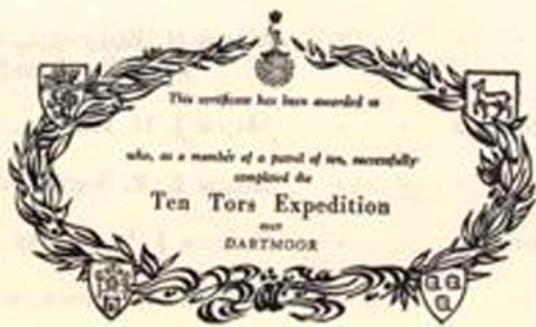
The 1960 Certificate