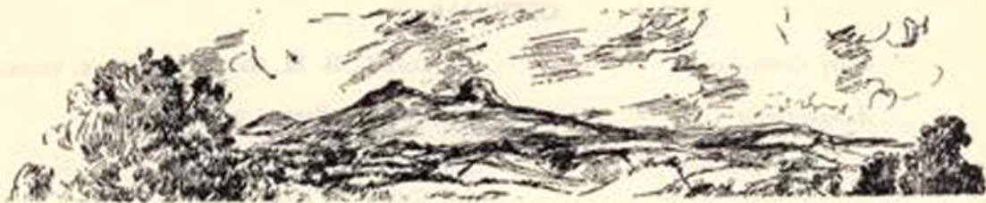
Haytor, looking out from Denbury.