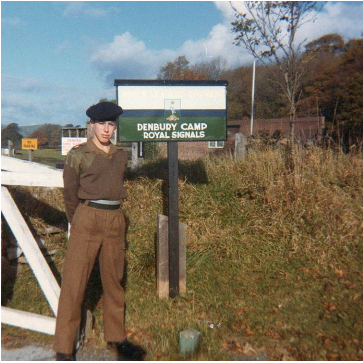
Pete White main gate