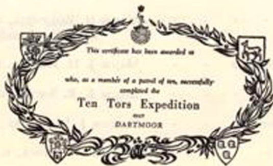
The 1960 Certificate