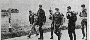
LEFT: The Ashburton County Secondary School had to hike and run on the moor. The boys had been practising for the meet for the past six weeks. ABOVE: The boys leave from the Teignmouth Venturers' ward during the youngest competition.

THEY called it the largest single gathering of youth ever to witness a military expedition in the county. Nearly 1,000 teenage boys and girls set off from Hapton in the grey dawn of Saturday morning. Their well-aid aim, to link round a 50-mile course, according to media descriptions, gave them at the start.