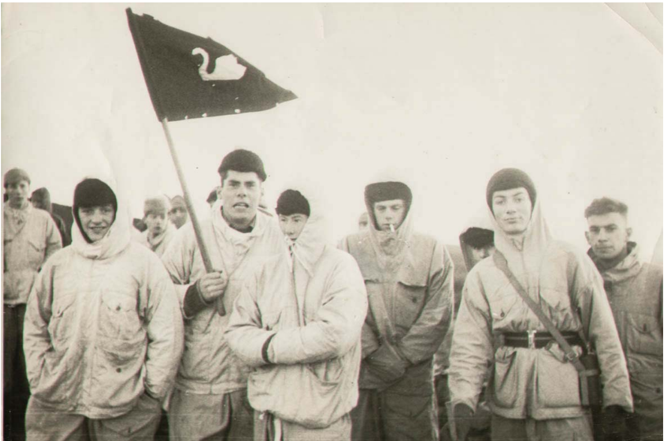
White Swan Troop Team with Iron Troop Team behind

Luckily the rain came only in showers but we were glad enough to be on the move after a quick breakfast. Hare Tor and Fur Tor made us puff, then going to Stannon Tor involved more "bog trotting" with Stannon behind us only Yar Tor remained but that was still fifteen miles from camp. These last miles were on the roads, which proved hard on feet, which were already tender. Nearing camp, after completing fifty miles in twenty-four hours marching time, we tried to focus our minds, on what had happened during that time, but the only thing in our minds was REST.