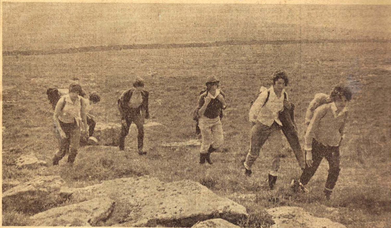
THE ASHBURTON GIRLS' TEAM PICTURED CLIMBING TO THE FIRST TOR.

W ILL the success—and evident enjoyment—of the boys and girls from Ashburton Secondary Modern School, who took part in the well organised Ten Tors Expedition, encourage other local schools to take part?