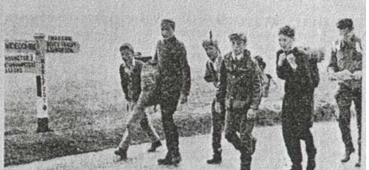
LEFT: The Ashburton County Secondary School had six boys and six girls entered. The boys had been practising for the event for the past six weeks. ABOVE: The two boys' teams from the Teignmouth Ventures' were among the youngest competitors.