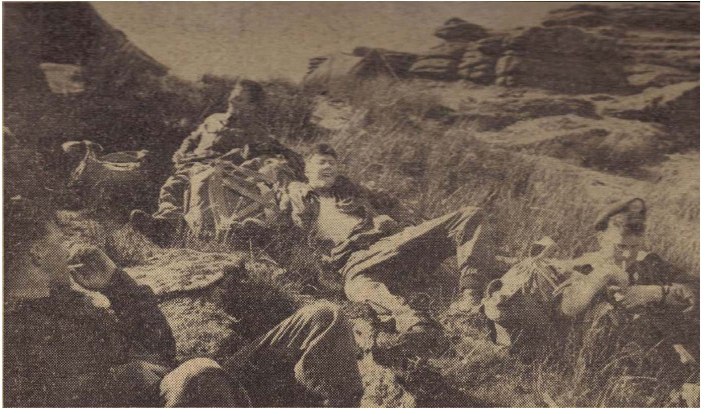
A team of R.A.F. boys resting at Yes Tor after checking in at the control point during the Ten Tors walk organised by the Junior Leaders Regiment, Royal Signals, Denbury, Newton Abbot.