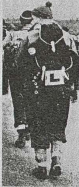
ABOVE: Don't let the "L" fool you. The rest of the outfit, particularly the boots, was just the ticket for a two-day hike across the last great wilderness of England. RIGHT: Newton Abbot, Bovey Tracey and Ipplepen Army Cadet Force units each sent a patrol on the expedition. This was the Ipplepen team en route.